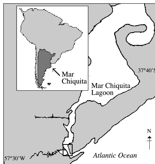
Figure 1. - Map of Mar Chiquita coastal lagoon, Argentina, with catch area of the six Mugil curema . [Carte du lagon côtier de Mar Chiquita, Argentine, et localité de capture des six Mugil curema .]

Six specimens of Mugil curema were captured in Mar Chiquita coastal lagoon, Argentina (37°32'S-57°19'W) (Fig. 1) on 26 May and 16 June 2003. Mar Chiquita coastal lagoon is a temperate shal-