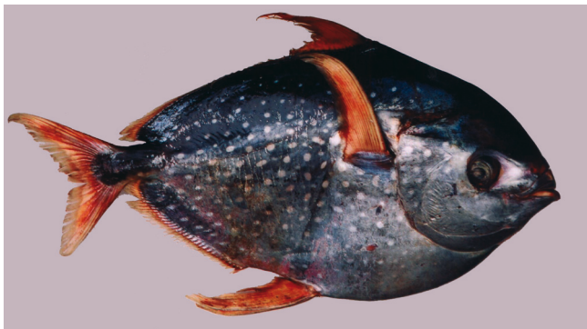
Figure 1. - Caught specimen of Lampris guttatus near island Vir, eastern Adriatic (TL = 98.3 cm; W = 25.57 kg). [ Lampris guttatus capturé près de l'île de Vir, Adriatique orientale (TL = 98,3 cm ; W = 25,57 kg).]