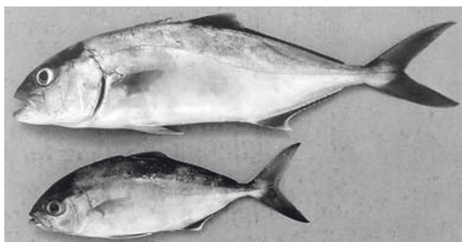
Figure 1. - Seriola dumerili (above) and S. fasciata (below) caught off Lampedusa Island. [ Seriola dumerili (en haut) et S. fasciata (en bas) capturées au large de l'île Lampedusa.]

In order to avoid a mistaken identification with S. dumerili , the identification of S. fasciata juveniles (Fig. 1) was based on the following combined features: stocky body against slender body of S. dumerili , according to Cervigón (1993); 7 distinct vertical dark body bars against 5 for S. dumerili (Fischer et al. , 1981); grey-yellowish against intense yellow body colour of S. dumerili ; grey pectoral, pelvic and caudal fins against intense yellow fins of S. dumerili ; different sizes at time of sampling: S. dumerili settles FADs