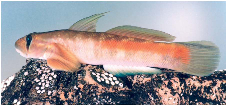
Figure 1. - Sicyopterus aiensis , n. sp. Holotype, MNHN 2003-268, male (83.9 mm SL); Creek Ai river (Efate island), Vanuatu, 16 July 2002, P. Keith and E. Vigneux.