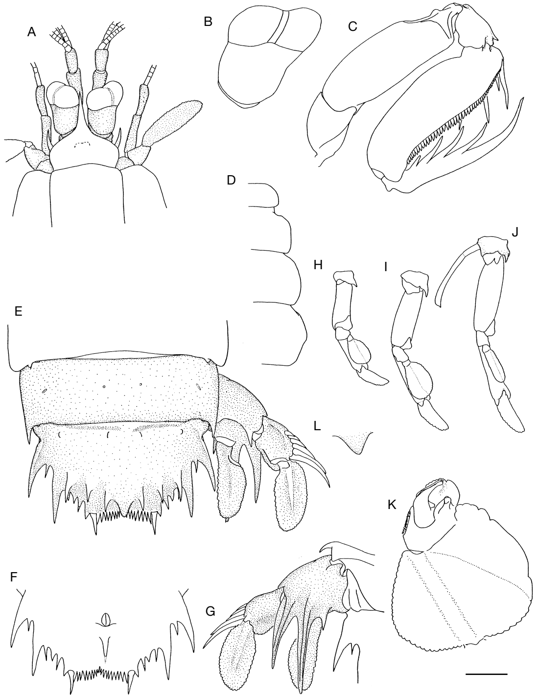
FIG. 2. — Kasim karubar n. sp., holotype (MNHN); A , anterior cephalon, dorsal; B , eye, right dorsal; C , raptorial claw, right lateral; D , TS5-8, right dorsal; E , AS5-6, telson and uropod, dorsal; F , telson, ventral; G , uropod, right ventral; H-J , pereiopods 1-3, right posterior; K , PLP1 endopod, right anterior; L , TS8 sternal keel, right lateral. Scale bar: A-J, 1.25 mm; K, L, 0.6 mm.